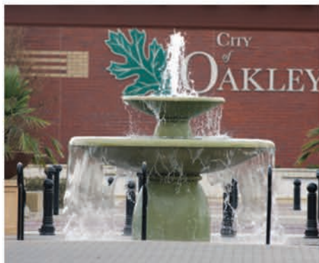
The fountain at Oakley Plaza is one of Oakley's top places to visit.

Readers selected Crockett Park as the Best Park in town. Crockett Park is home to the World of Discovery all-abilities playground, which draws families from all over East County. Located at 4150 Richards Way, Crockett Park has large lush grass fields, picnic tables, benches and barbecues. The park also boasts tennis and basketball courts so there is truly something for everyone to enjoy. Best of Oakley voters are also showing love to