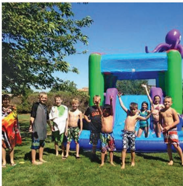
Kids of all ages have fun in jumpy houses, ball pits and water slides from Ozone Party Rentals.

Glow Wellness and Herbs offers a personalized, holistic and alternative approach to health and wellness. Offering herbal supplements and vitamin products to treat weight issues, fertility, hormone and pregnancy challenges, Glow will custom design a program to help you find your balance and personal best. Glow Wellness and Herbs also offers life coaching. See ad on page 33.