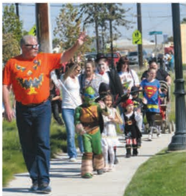
Oakley residents enjoy community events, such as the Harvest Festival.

support to all of Oakley's residents. The church hosts an annual water safety day for children and gives free life jackets to children younger than 7. Church members also participate in Relay For Life and collect donations for the American Cancer Society.