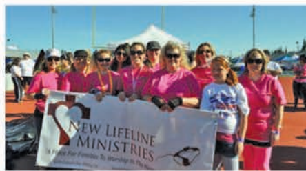
Readers voted New Lifeline Ministries, seen here at Oakley Relay For Life, as one of Oakley's most community-minded businesses.